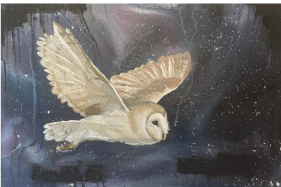
"All is Well"