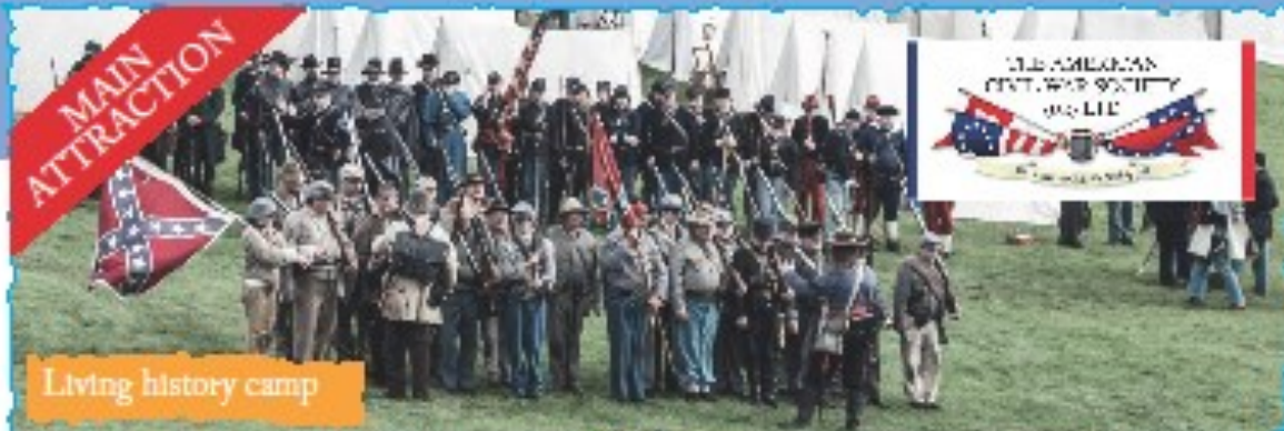
Living history camp

Saturday - Skirmishes and load cannon and musket fire. Sunday - Children's army, marching and skirmish displays