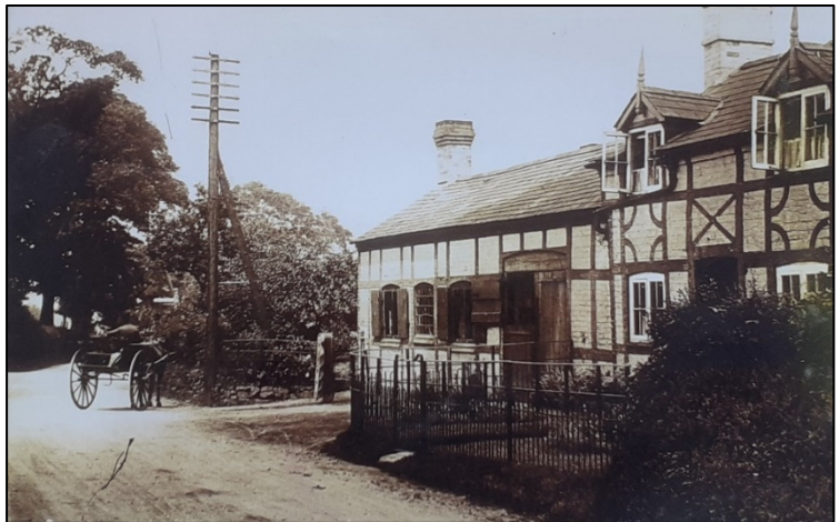
The Old Smithy, Macefen (formerly at the A41/Bradley junction)